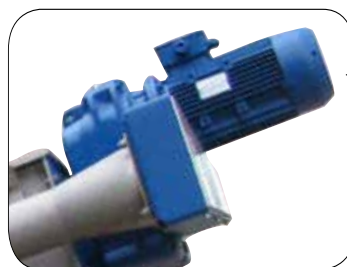
Single drive unit for drum and conveyor screw