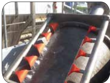
Rotary drum with cleaning nozzles